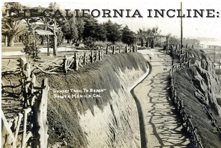
Sunset Trail walkway, circa 1900

By Sara Crown, SMHM Archivist and Ayesha Haas, SMHM Volunteer