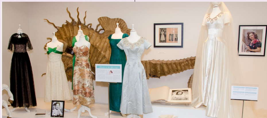
Shirley Temple's personal clothing, including her 1945 wedding gown on display.