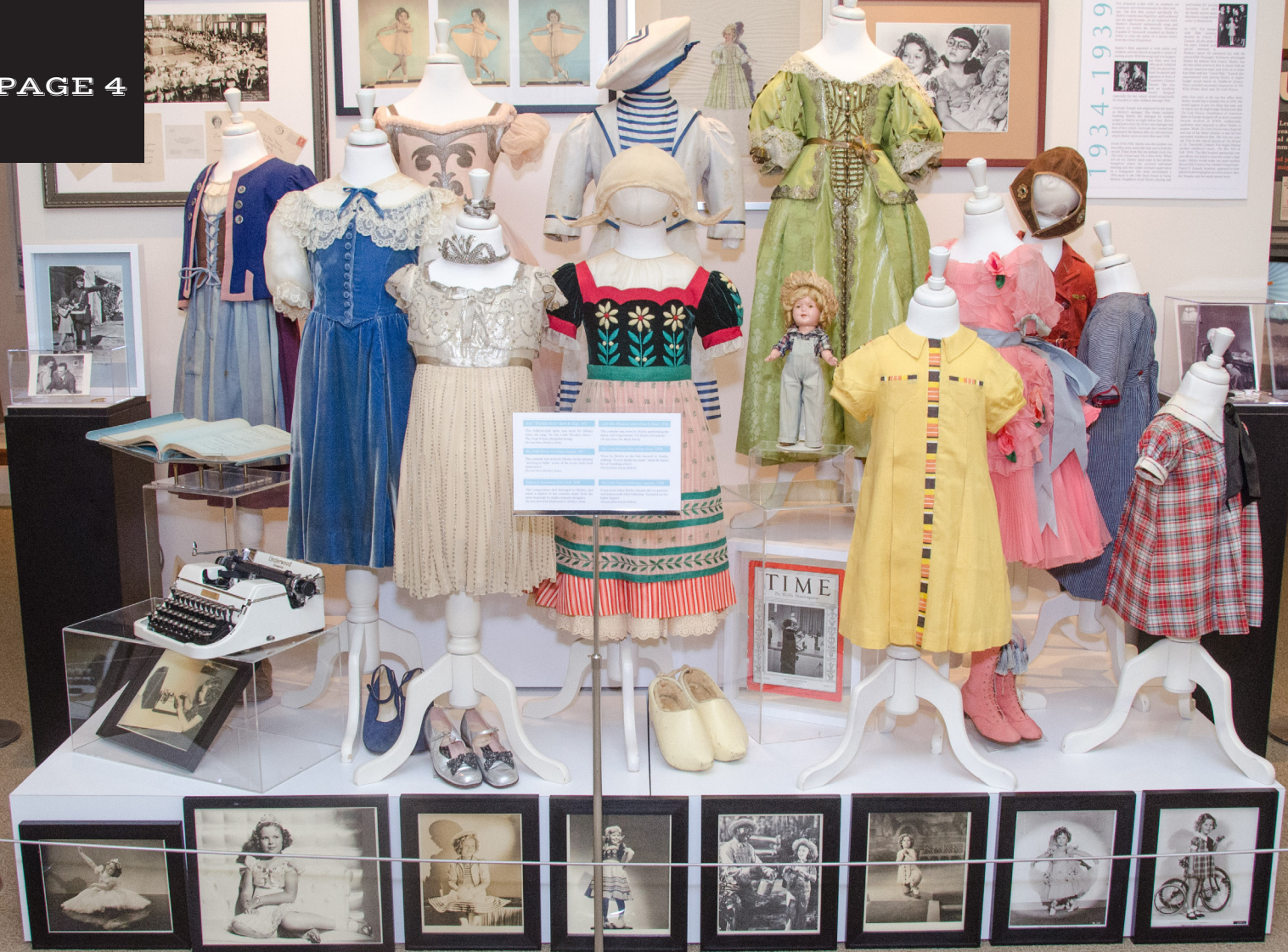
Film costumes from the height of Shirley Temple's acting career on display.