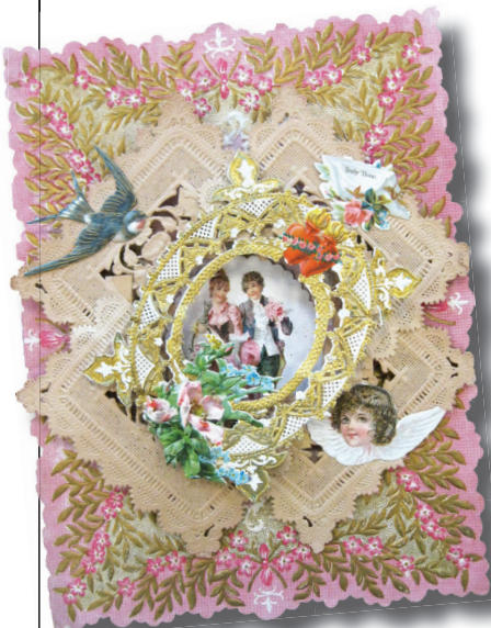
Antique Valentine card that was featured in the museum's exhibit.

November 19th Native American Heritage Month