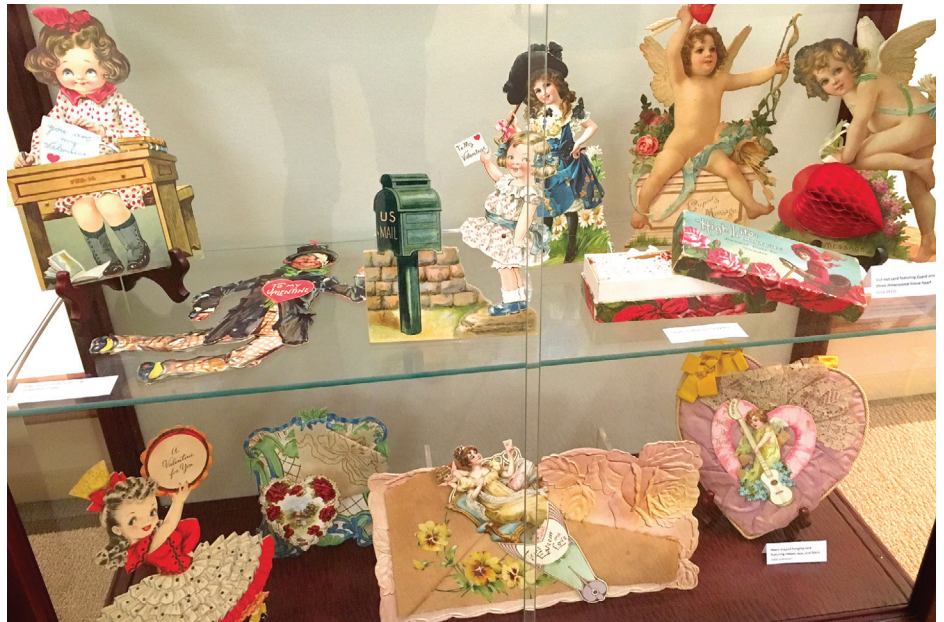
Vintage and antique Valentine cards on display.