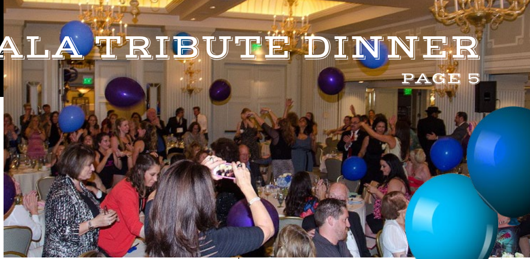
Ballroom filled with people and launched balloons.