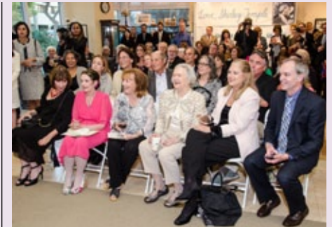
Audience enjoys a lecture at the Love, Shirley Temple Exhibit including actress Margaret O'Brien in pink.