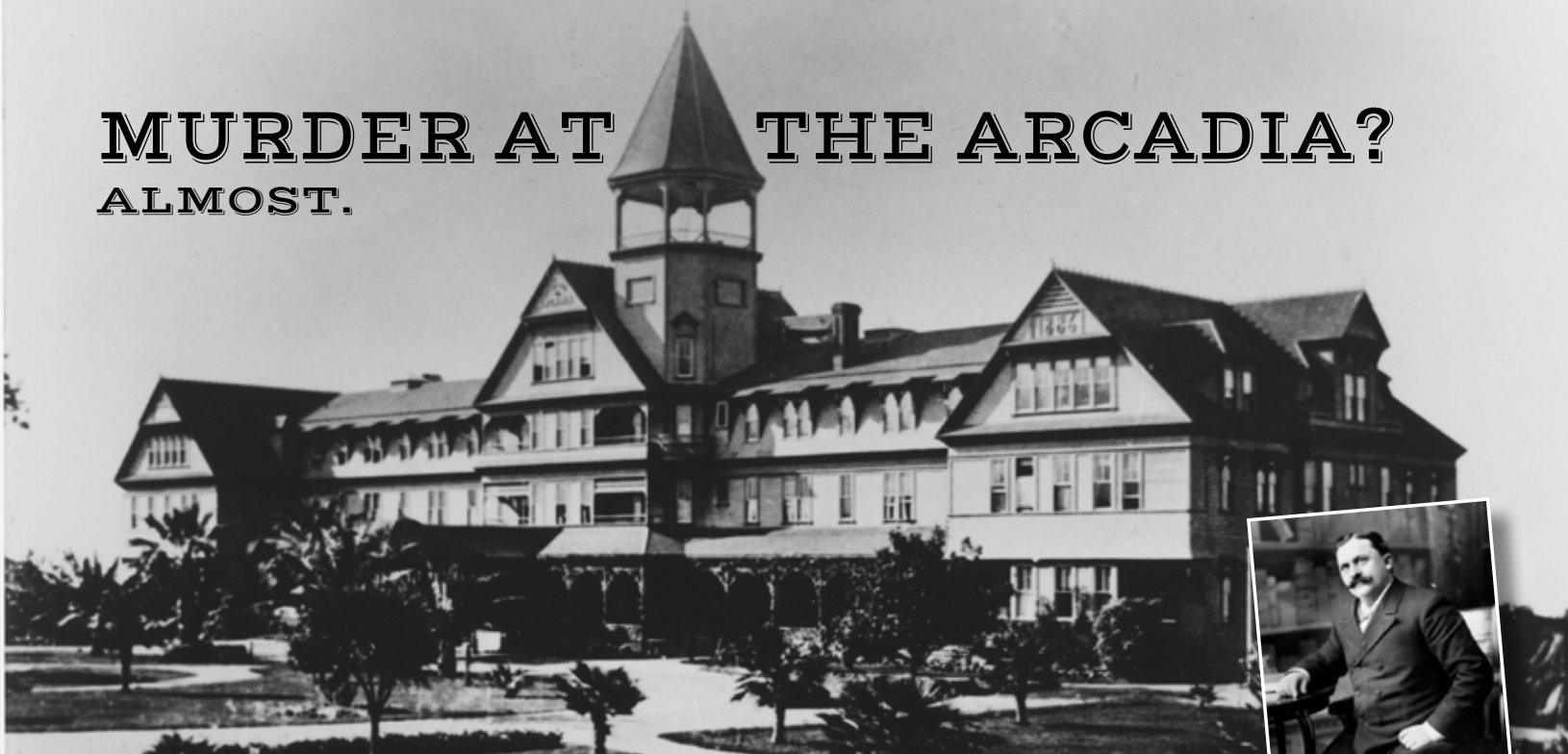
Griffith J. Griffith donated the land for Griffith Park.