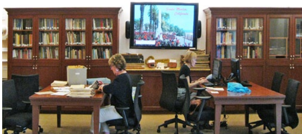
Museum's Morley Builders Research Library

Founded under the Historical Activities Committee of the Santa Monica Centennial Celebration in 1975, the Santa Monica History Museum is a "Santa Monica Treasure." Originally known as the Santa Monica Historical Society, it was designated as the official collector and preserver of the history, art, and culture of the Santa Monica Bay Area.