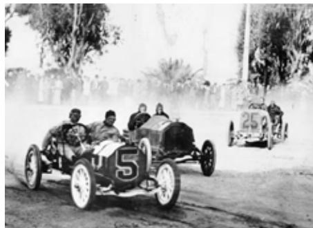
1909. The course of the two-man race cars covered San Vicente Boulevard, Ocean Avenue and Wilshire Blvd.